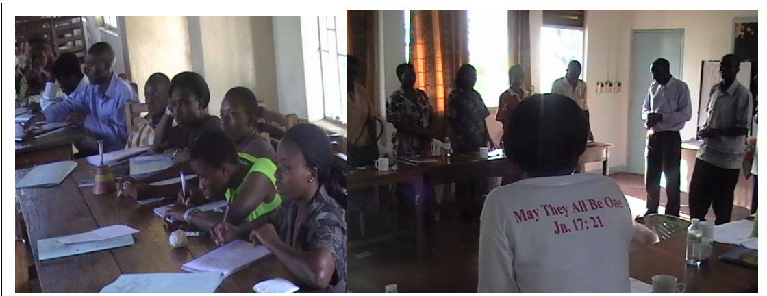
Some of the captions of participants during training sessions

After successful registration and acquisition of office, the youth desk in collaboration with the local faith communities brought together the youth for a training camp in peace building. Participants were drawn from the cultural institutions such as kingdoms, and faith institutions namely the Bahai faith, Buddhism, Christianity, Hinduism, Islam and Judaism while taking keen interest in fair gender representation.