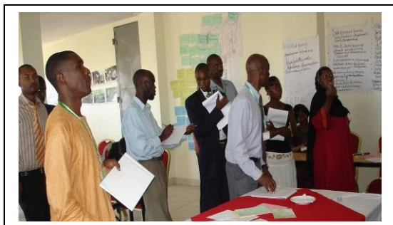
Some of the participants during the consultation

After establishment of regional networks with contact persons, the next logical question was what next? However, the IFAPA Commission had already foreseen this and after further consultation, a youth summit / consultation was organized and hosted by the youth desk at Pope John Paul II Memorial Centre in Kampala, Uganda. The event brought together the youth from the various countries and regions of the Continent for training and consultation.