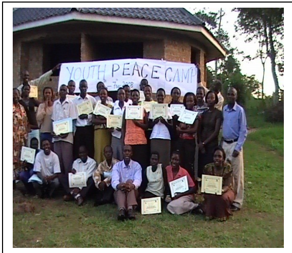
A Section of some of the Peace Camp participants holding their certificates

The event took place at the Uganda Joint Christian Council Peace village in Mukono, Uganda. The training enhanced local involvement, and ensuring that the capacity of the youth to fully participate in the peace building processes is achieved. This also enabled participants to constitute into an inter-faith youth peace forum in the country. Participants also vowed to Promote youth action based on spiritual and cultural values addressing issues of meaningful peace through regular consultations, networking, advocacy, and seeking further training.