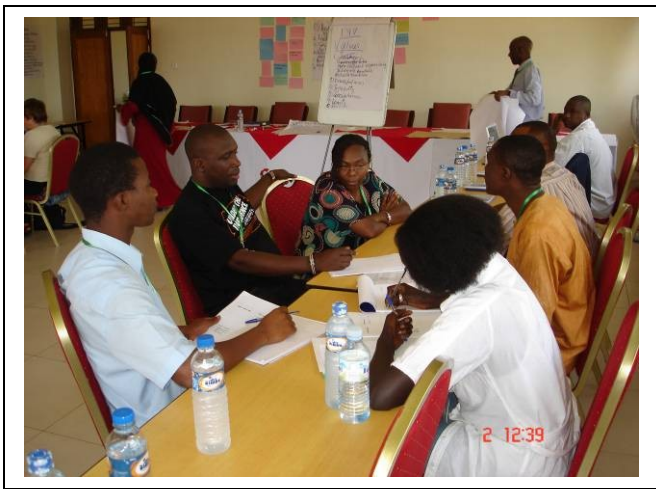
Some of the participants during a breakup session

During the Consultation, participants constituted themselves into a continental inter-faith youth forum. This forum was named the “ IFAPA Youth Voice ” abbreviated as IYV. See page 1 for the adopted logo. It was during the same event that participants developed and adopted a 3 years strategic plan. Among the highlighted issues in the plan were, civic education for the youth communities especially as the most African countries prepare for election, developing a resource mobilization strategy for the IYV, further training in peace building, involvement in addressing issues of climate change among others.